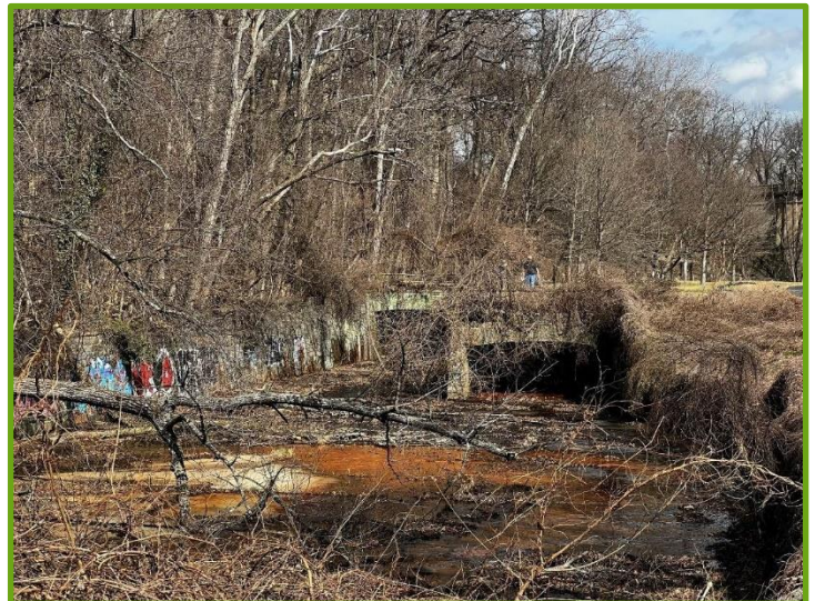
Upstream view of the existing CSO 049 outfall

This project is needed to reduce CSOs that contribute to poor water quality in Piney Branch and ultimately the Potomac River and Chesapeake Bay; and to comply with the 2005 Federal Consent Decree entered into by DC Water, the District of Columbia, the USEPA, and the US Department of Justice, as amended January 2016.