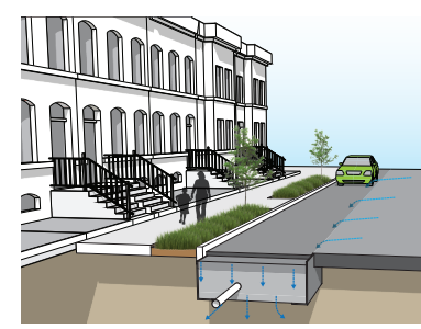
Parking Lane Permeable Pavement

DC Water thanks you for your patience during construction of green infrastructure. We hope you enjoy the improvements to your neighborhood!