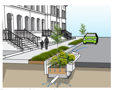
Curb Extension Bioretention