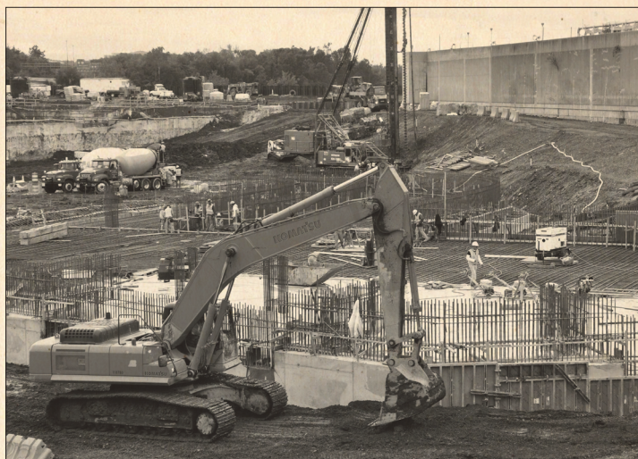
Work on the Enhanced Nutrient Removal Facilities (ENRF) began in 2011 and is due to be completed in 2014. It is just one of three massive construction projects on Blue Plains.