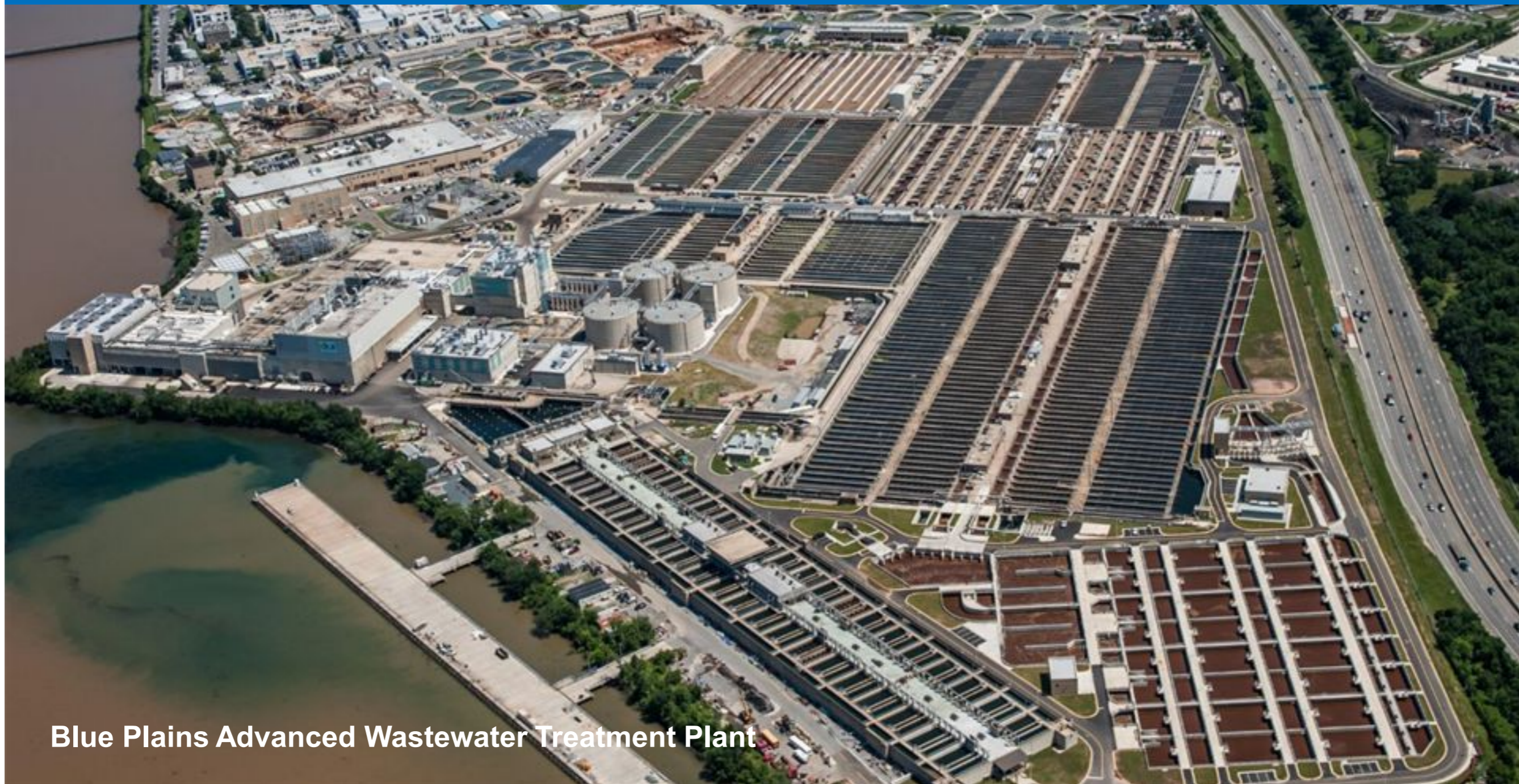
Blue Plains Advanced Wastewater Treatment Plant

District of Columbia Water and Sewer Authority