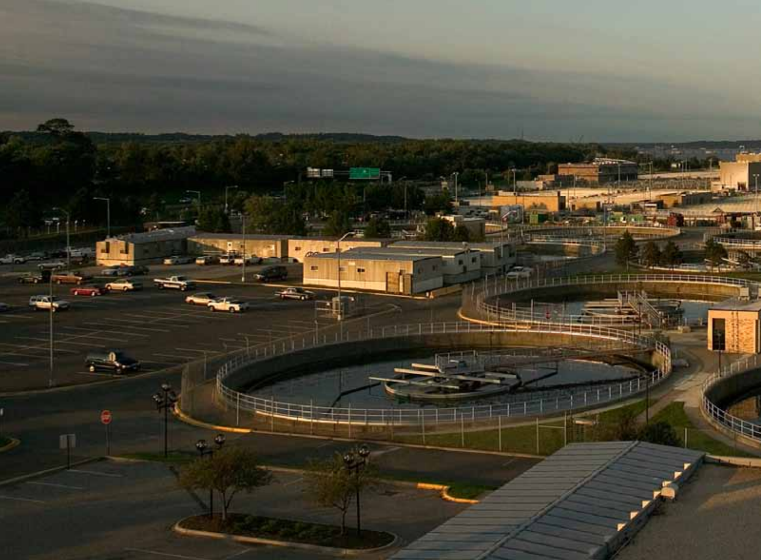
The size and complexity of the Blue Plains plant made it difficult for staff to share vital information.

disinvestment in existing assets. A state-of-the-art distributed control system also was implemented. But physical upgrades of assets, while critical, were not enough to reach the bar set by the board. In order for the benefits of these upgrades to be fully realized, the work force also had to change.