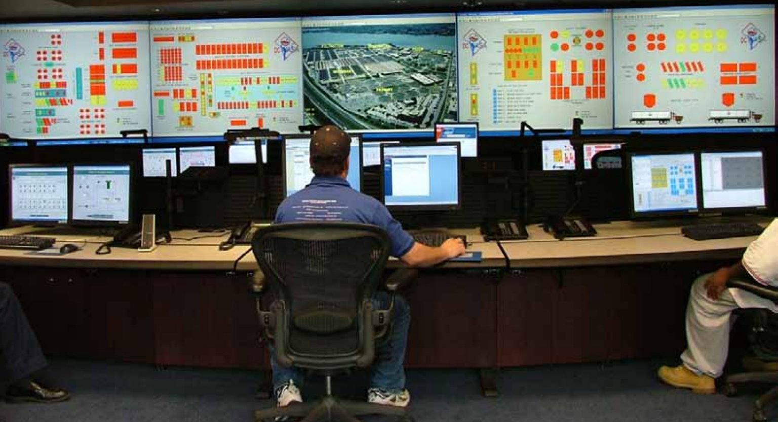
The benefits of physical plant upgrades such as the supervisory control and data acquisition system were fully realized once staff training and enhanced communication tools were implemented. DC Water