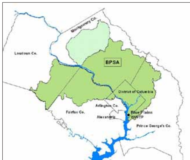
The Blue Plains plant serves an extensive area including Washington, D.C., and parts of Virginia and Maryland.

without exception. It took nearly 6 months to achieve compliance.