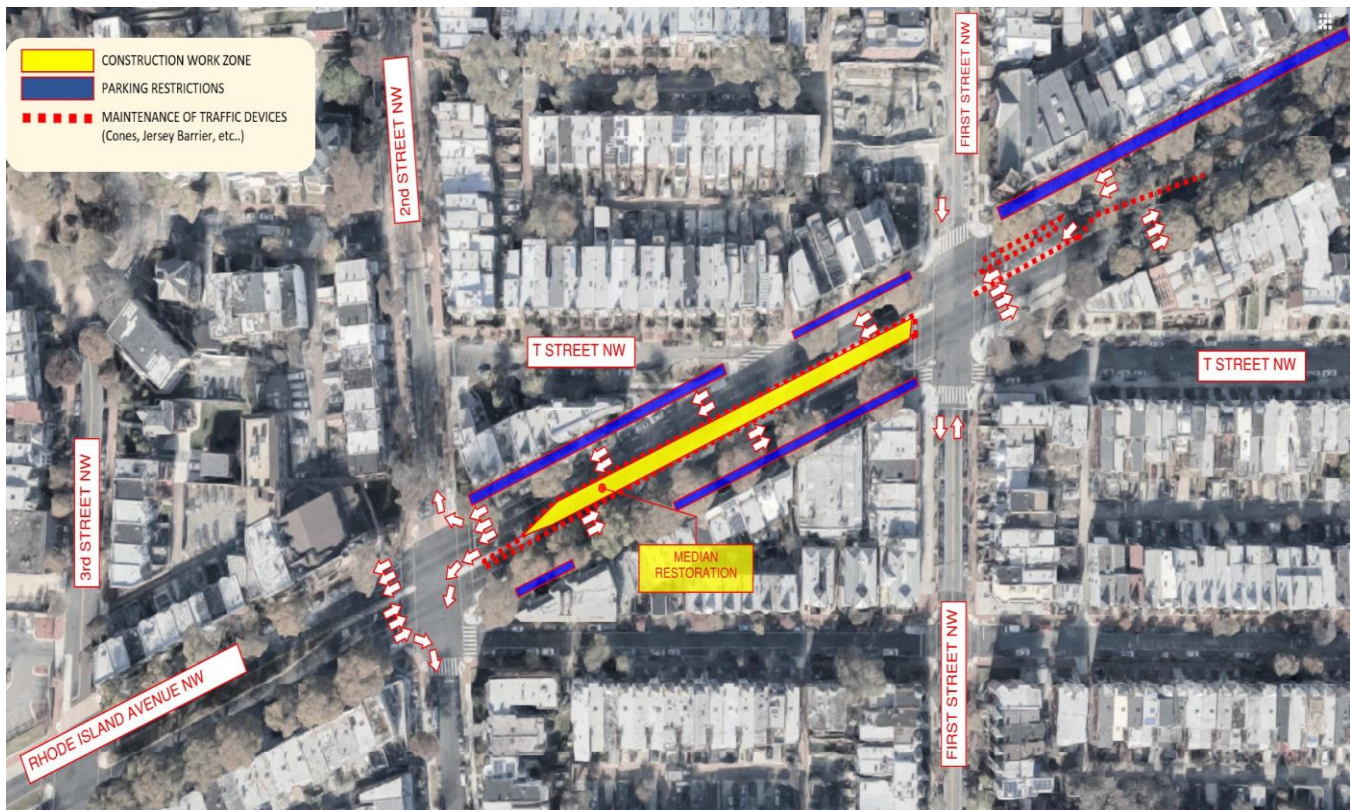
Phase 1 map shows construction sites in yellow, traffic flow indicated by white arrows, and parking restrictions represented by blue lines.

Work hours will be from 9:30 AM to 3:30 PM, Monday through Friday, and on Saturday from 7:00 AM to 3:00 PM. Each phase is anticipated to last 10-12 days. Residents will be notified as the contractor transitions from phase one to two.