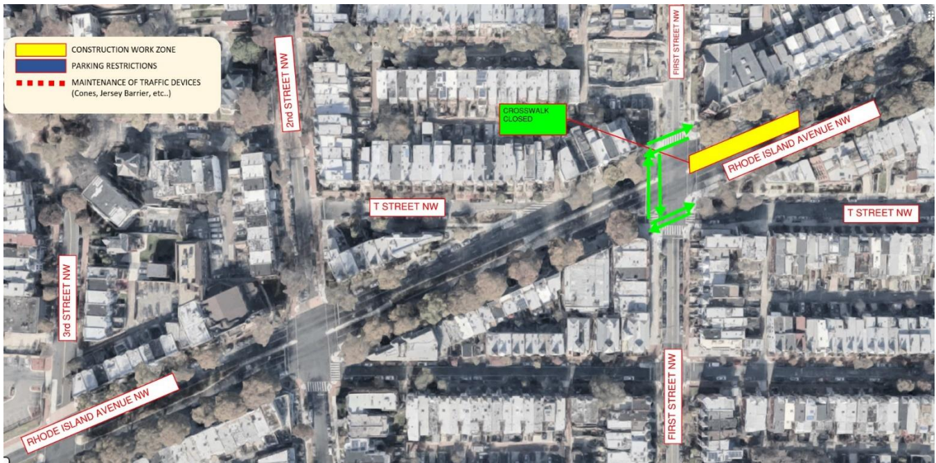
The above map shows construction sites in yellow, green arrows indicate how pedestrians will move around the construction area.