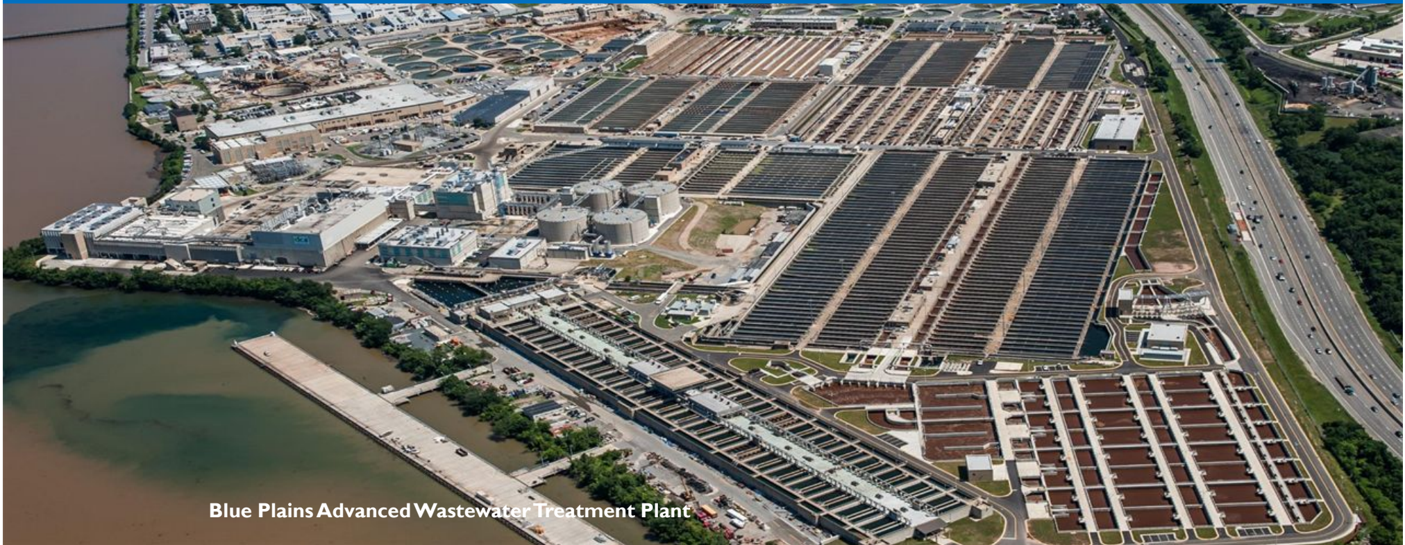
Blue Plains Advanced Wastewater Treatment Plant